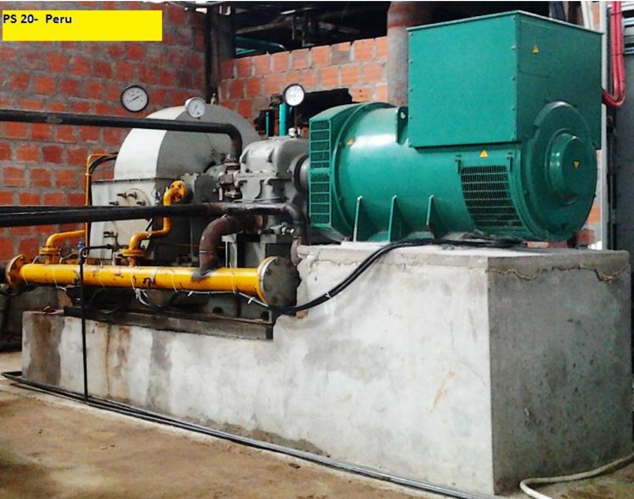
PS20:Saw Mill, Peru