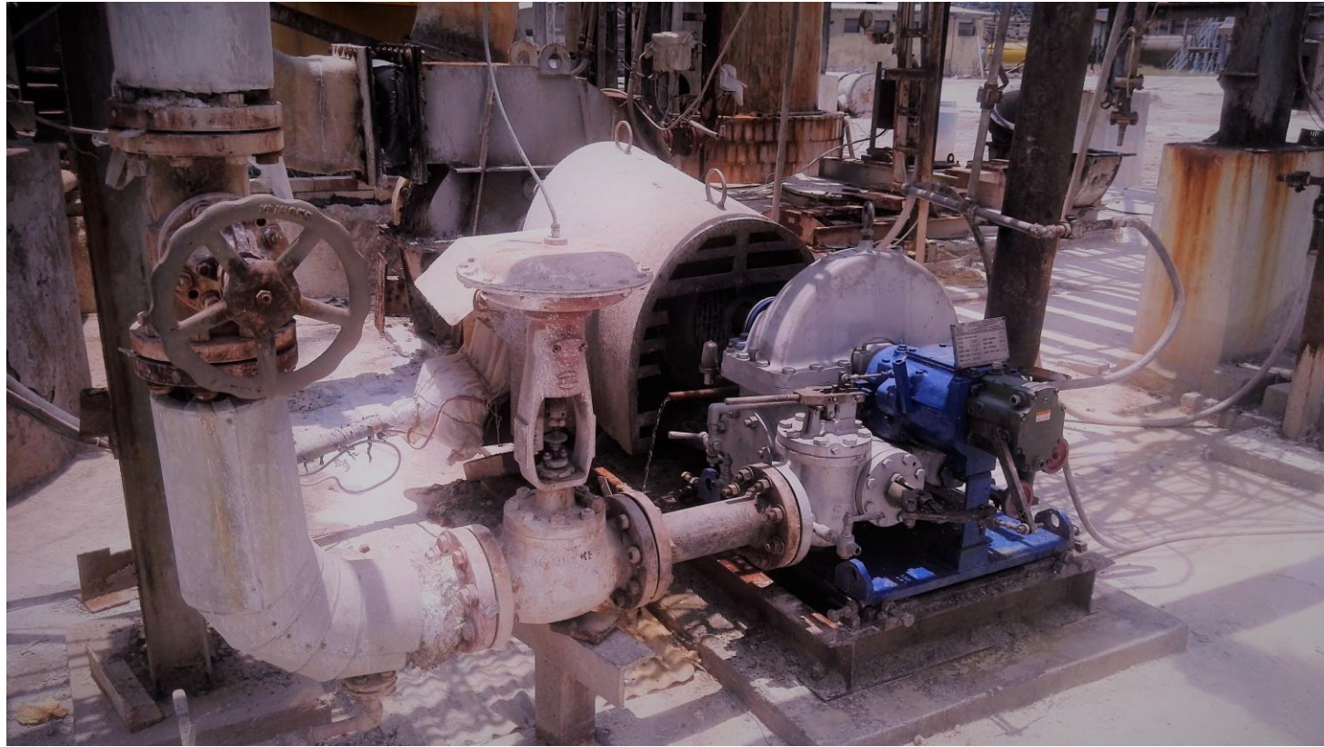
PS10: KMML, India